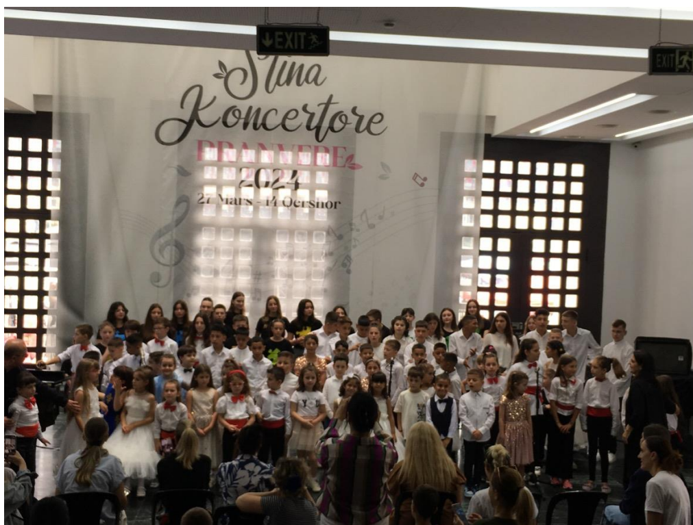
Singing "We Are the World"

The choir members, who regularly practice during the school years two to three times a week, are between the ages of 10 and 14. They leave the choir once they finish primary school, and every year is a new challenge for the choir. As a reward for their hard work and persistence, this year, with support from the Macedonian Schools Project, the Bratstvo Edinstvo Choir took part in the Cherries Festival in Tirana, Albania, and celebrated Children's Day on June 1, 2024, along with choirs from four different countries. At the end of the day, members from all the choirs joined together to sing "We Are the World," sending a message that said children are the future of the world, and we should live in peace and harmony.