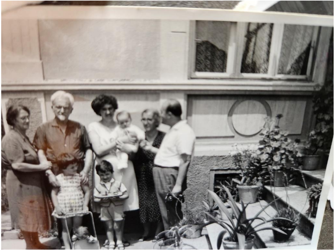
My Family in Bitola, circa 1964

After my family from both sides lost everything following the end of World War II, as part of the bourgeoisie my parents decided to create memories instead of material wealth. Throughout my childhood, adolescence and growing up, I was inspired by all the travels we did together, exploring new horizons, meeting people, and trying different cuisines around Europe.